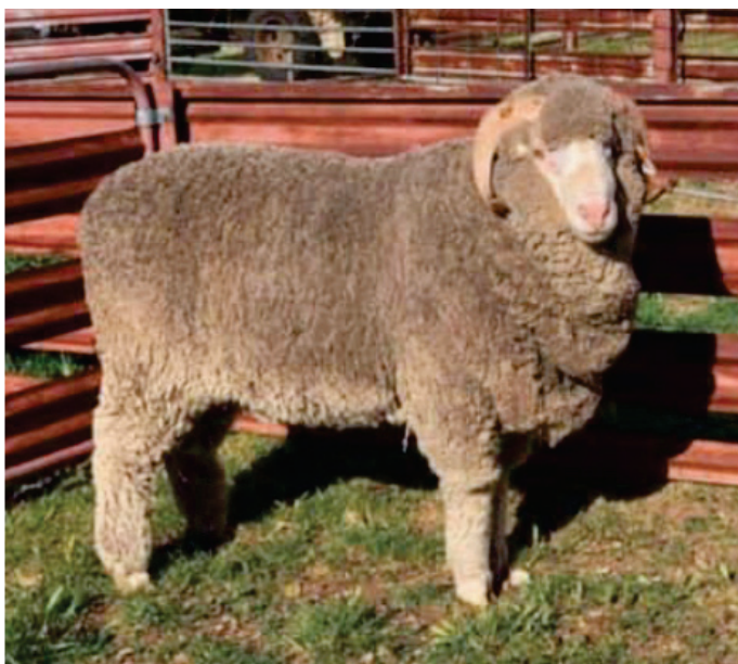
The new Main Range $31 000 sire purchased from Cottage Park , cut 14kg with 8 months wool.