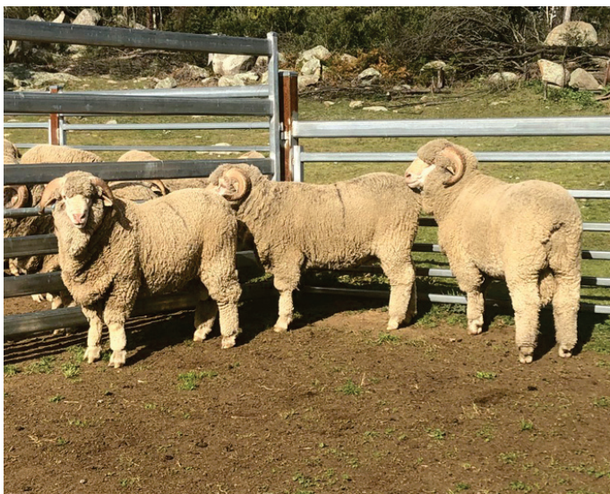
Boudjah Lots 34, 22 & 21