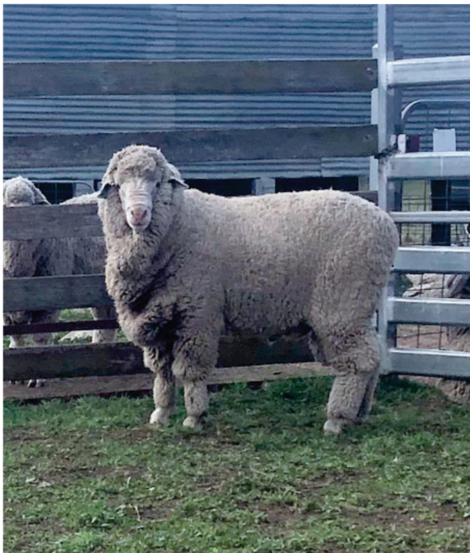
Boudjah Lot 35, Tag 315. Son of OQQ.